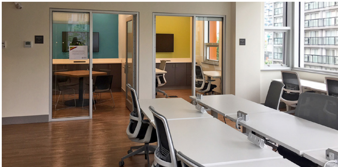
5th floor administration area and offices